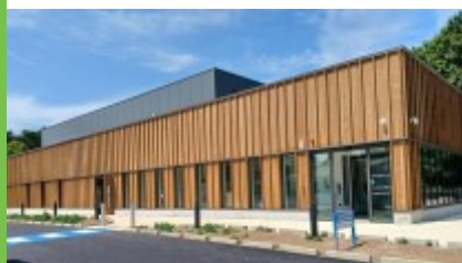
THE CORBY COMMUNITY DIAGNOSTIC CENTRE (CDC) AT THE WILLOWBROOK HEALTH CENTRE

We also have news of a new Community Diagnostic Centre at Willowbrook Health Centre in Corby , now open daily and offering around 93,000 tests a year. This purpose-built service is helping people get quicker diagnoses closer to home, easing pressure on hospital site. Whitworth Hospital in Darley Dale celebrate the completion of a new clinical area and upgrade staff facility thanks to a generous donation by the Matlock Hospitals League of Friends. Victoria Community Hospital in Wimborne , was in the news recently about a local pilot that has helped reduce long hospital stays from 13 patients to none. With a strong focus on rehabilitation and reablement, more people are returning home sooner and regaining independence. There are developments at the Princess of Wales Community Hospital in Bromsgrove, where a £1.6 million expansion of the Minor Injuries Unit is nearly complete. The upgraded space will double capacity and ease pressure on A&E, with new treatment rooms and specialist facilities opening soon.